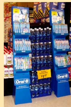
Fred Meyer Displays

Approved 250 Oral-B floor stand displays (2 per store) for placement next to Aquafina. Joint ad also approved.