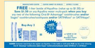
IRC Take-one Pad