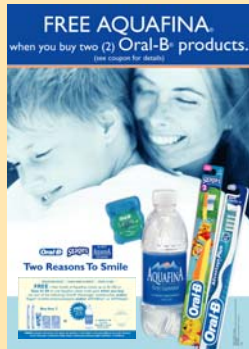
POS with IRC Take-one Pad