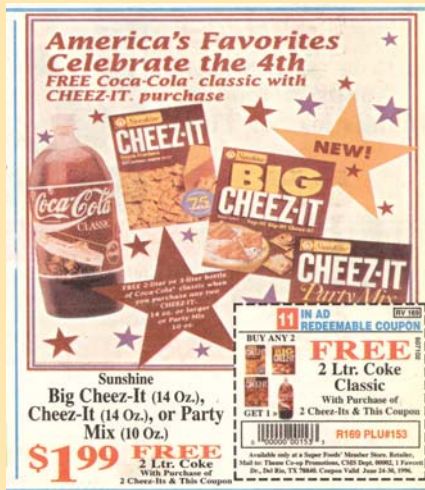
Feature Ad with In-ad Coupon