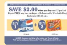
IRC On-pack Sticker