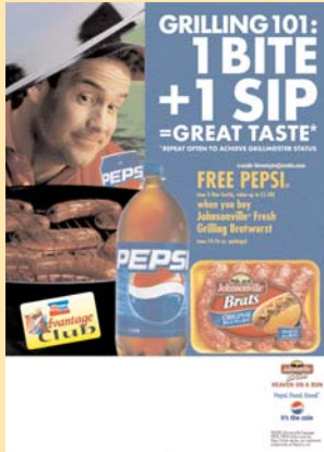
POS Display Card