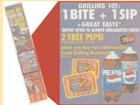
In-ad Loyalty Card Scanner Offer

Partnership offer executed via loyalty card. Offer announced in Pathmark feature ad and in-store on POS. Pepsi also merchandised IRC bottleneckers on display.