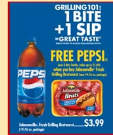
In-ad Scanner Offer